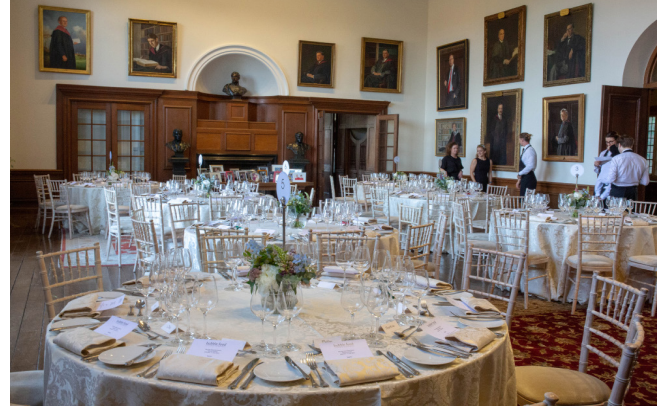
Old Harrovian Room Civil Wedding