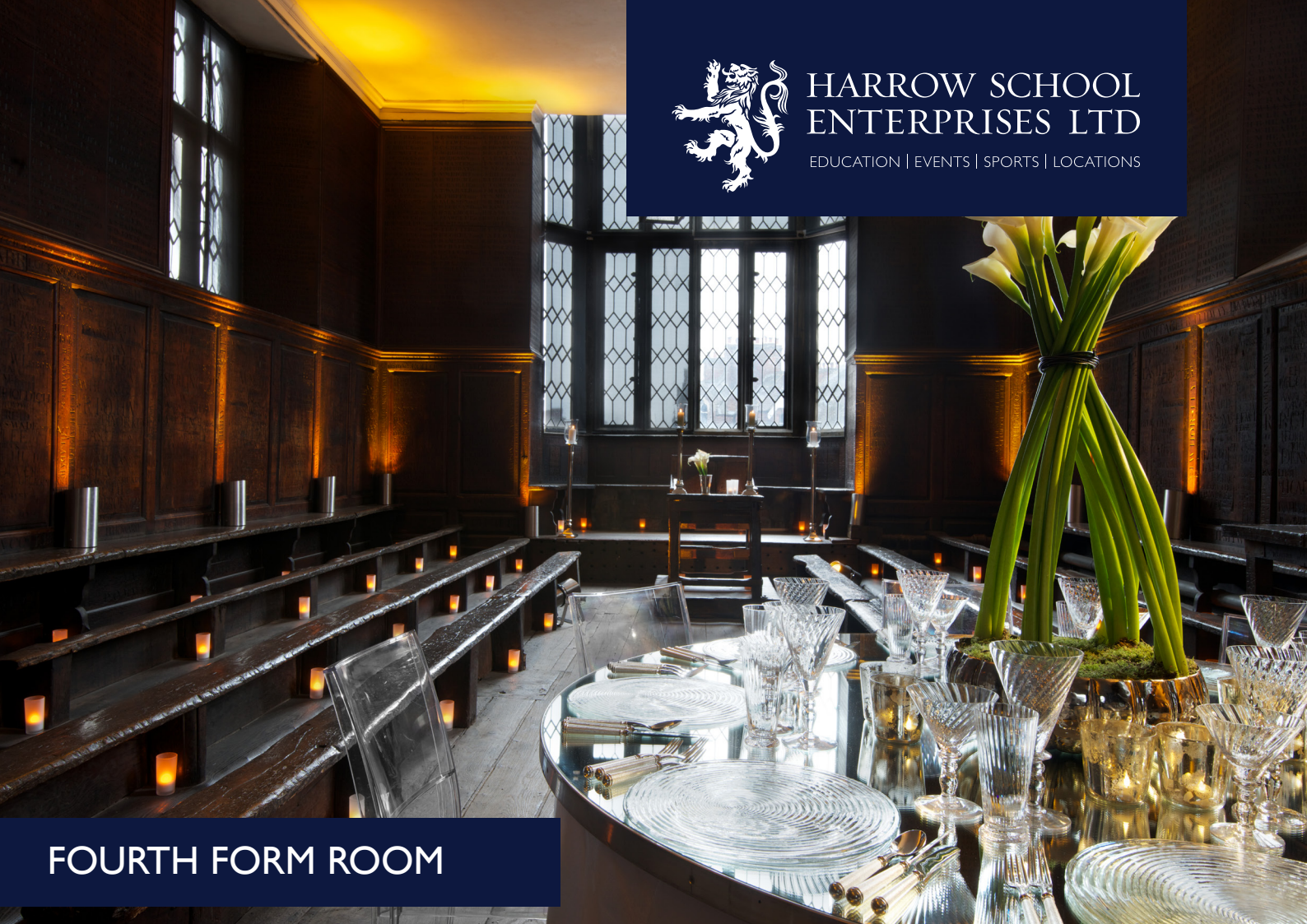
FOURTH FORM ROOM