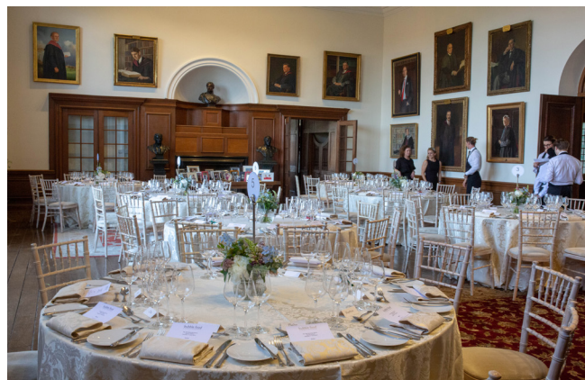
Old Harrovian Room Wedding Reception