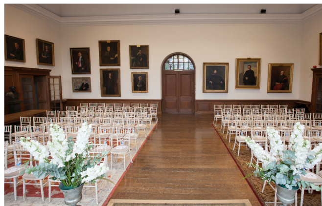
Old Harrovian Room Civil Wedding