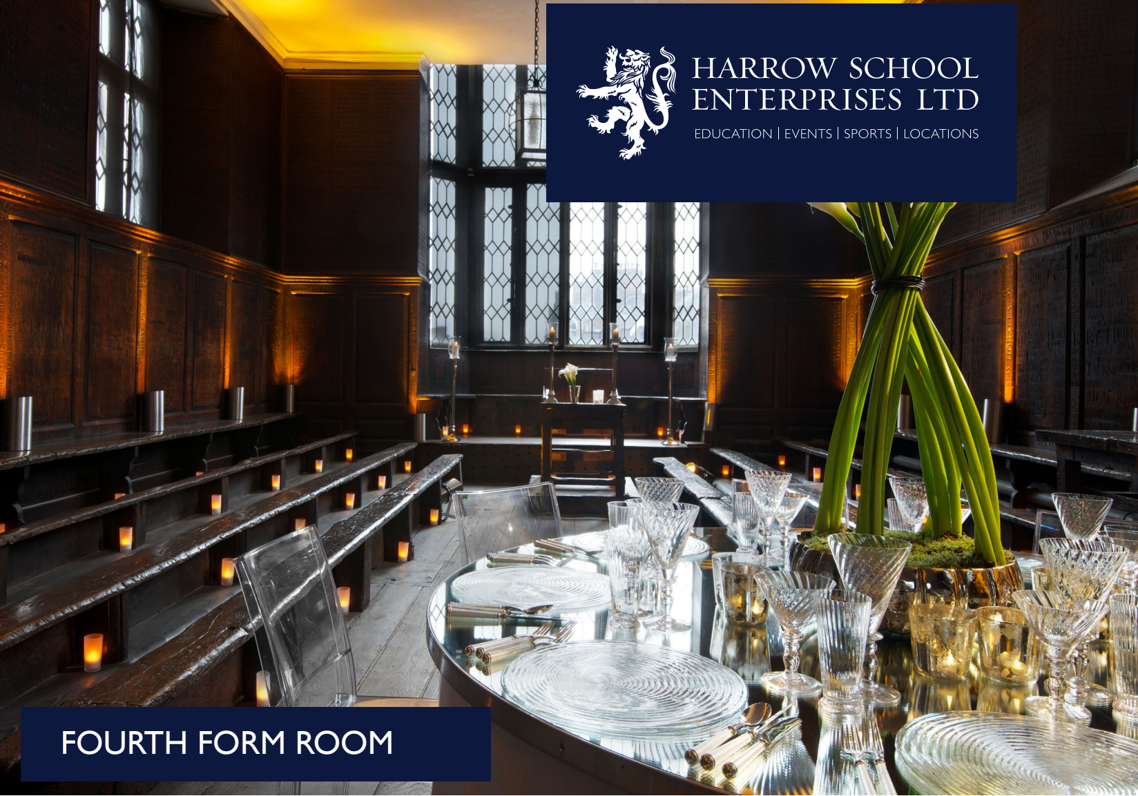
FOURTH FORM ROOM