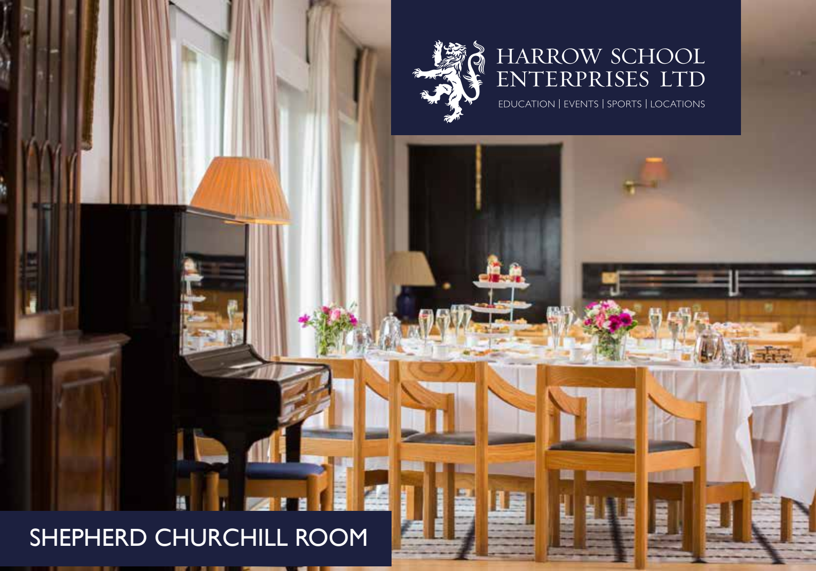
SHEPHERD CHURCHILL ROOM