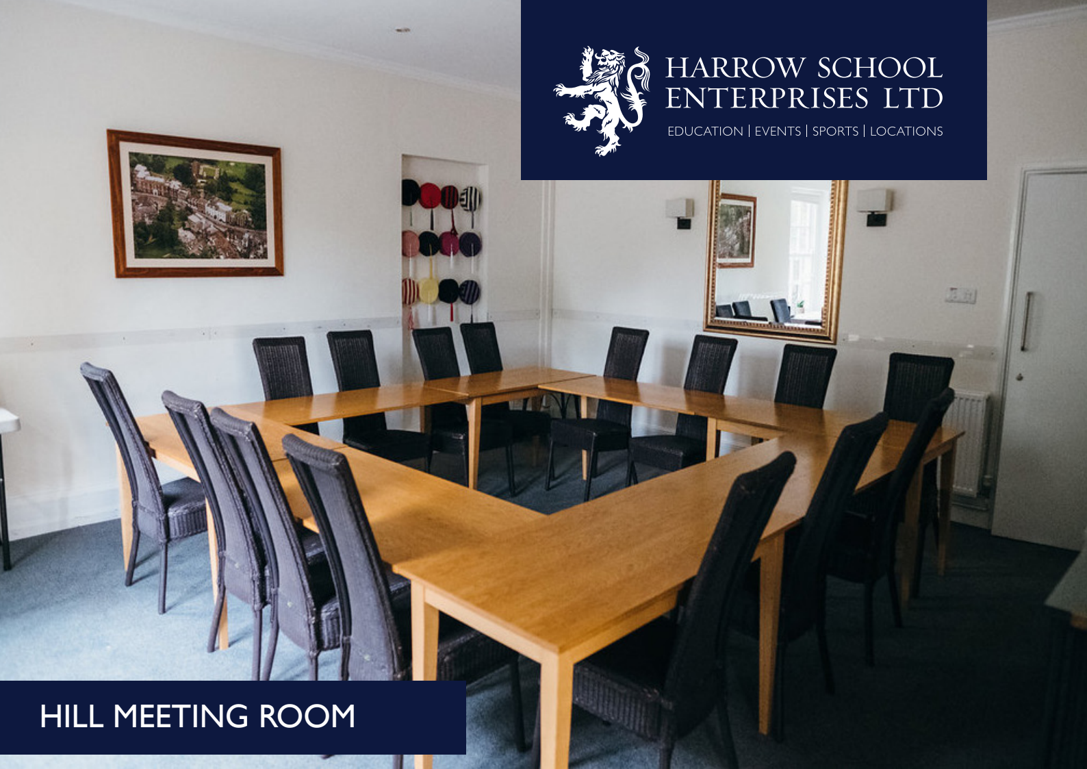
HILL MEETING ROOM